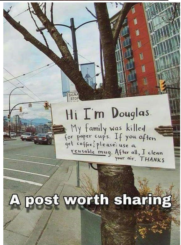
A post worth sharing

Church ECO website: costaecogroup.wixsite.com/website-3Church ECO group Facebook page: Costa del Sol Eco group