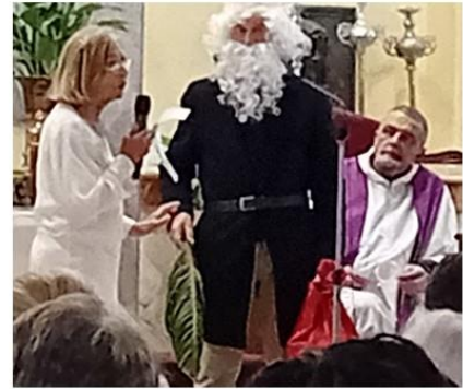
Father Christmas aka The German Pastor